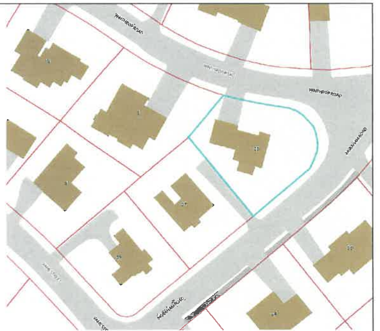
WELLESLEY GIS LOCUS MAP NOT TO SCALE

AVG. GRADE AT DWELLING: 127.6 FIRST FLOOR THRESHOLD: 129.5 EXISTING RIDGE: 161.7 ELEVATIONS REFER TO NAVD 1988